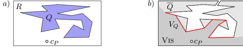
Fig. 2. a) A simple polygon Q and a rectangle R enclosing both c_P and Q . By removing Q from R we obtain a polygon with one hole. b) The simple polygon \bar{Q} obtained by connecting the hole with the boundary of R . In red, the visible chain V_Q of \bar{Q} from c_P .

B_P(S) , p is farther away from b_P(S) than any other point of P . That is, \gamma_p is the last cone intersected by \sigma . Therefore, \gamma_p intersects Y_j and consequently p \in P'_j . \square